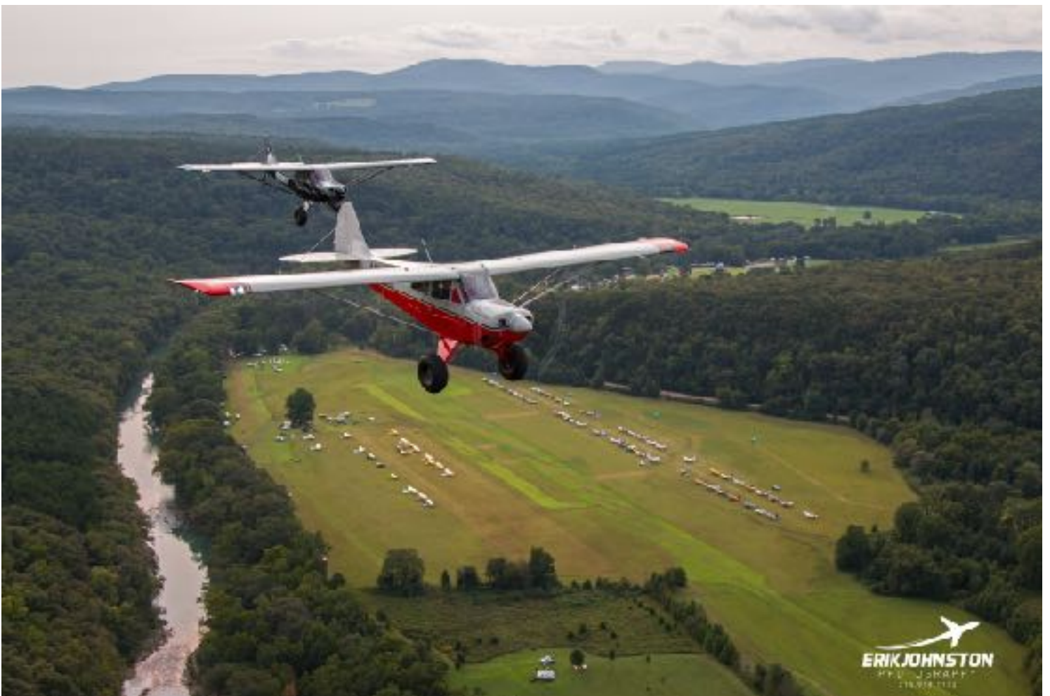
Huskys on dawn patrol over Byrd's Adventure Center.