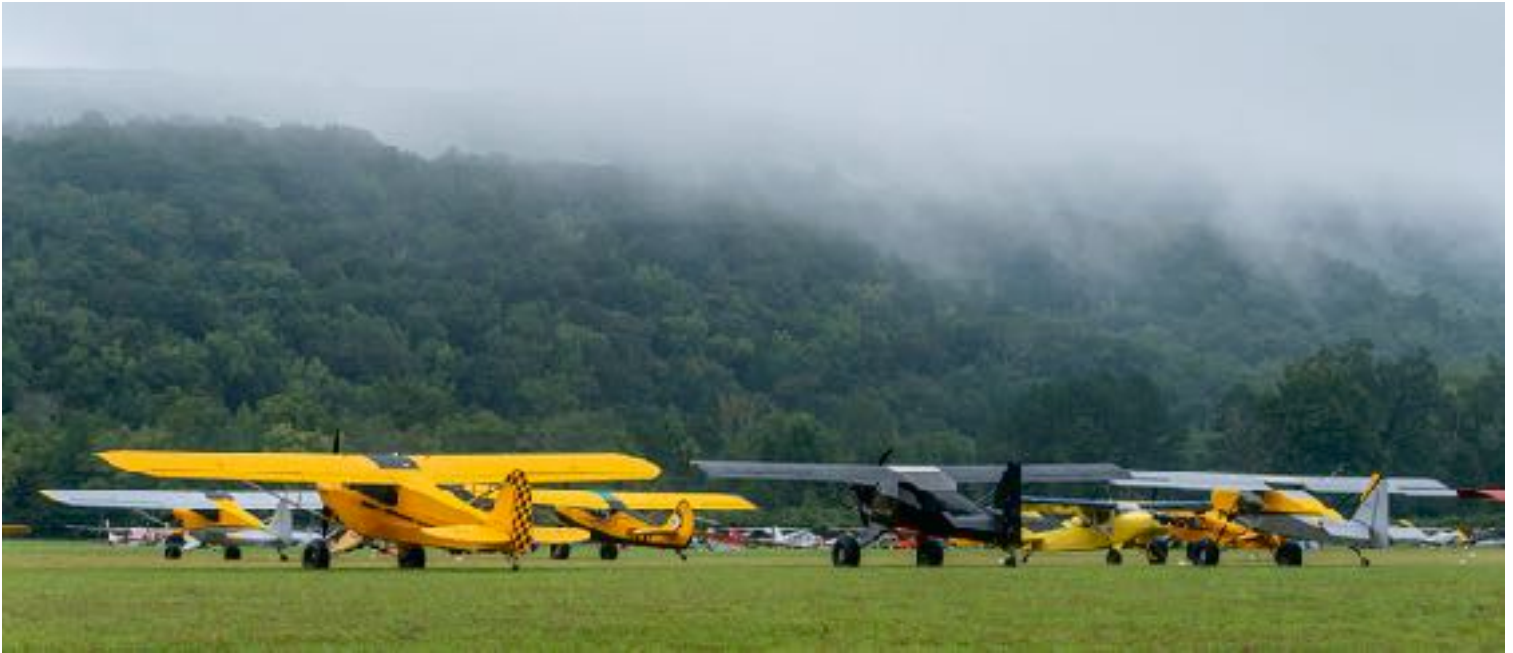
Competition aircraft staged at Byrd's Adventure Center waiting for the fog to clear

Photo caption guide: Full res photos included in press kit.